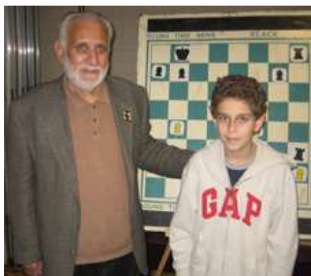
GM Larry Evans with Naroditsky

DN: I am writing one on endgames right now. Originally I didn't like to study endgames but Gregory Kaidanov brought a love for endings into my game. And Lev Psakhis, who is coaching me now, is a huge endgame specialist. I learned a lot of things about endings that I've never heard before and I hope to share some of them in my next book.