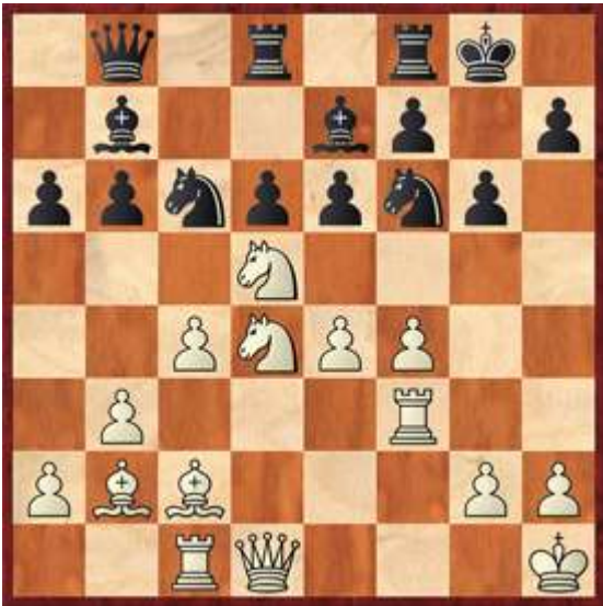
Romanishin-Petrosian, Yerevan 1975 Position after 16. Nc3-d5