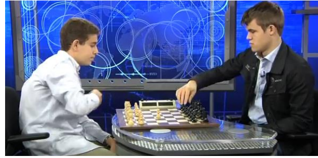
Local Prodigy Daniel Naroditsky versus Magnus

While on his way to Mexico, the worlds' highest rated player Magnus Carlsen made a couple of stops in California. He met such notables as musician Fred Durst and had lunch with Art Levinson the chairman of the board of Apple. He also took the time to show off his chess skills in the San Francisco Bay area.