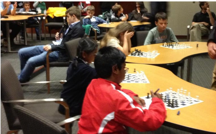
Magus with his back to his 4 opponents

http://www.youtube.com/watch?v=FxNCMOrzz6A